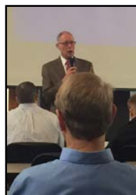
Mayor Paul Esser