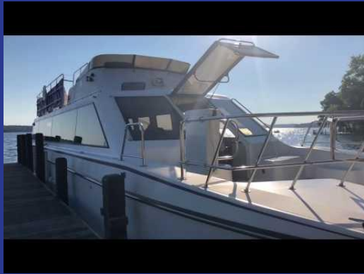
Green Lake Member Boat Ride